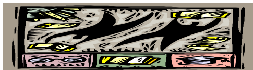
U3A City of Melbourne Inc. — May 2008

. . . by visiting the U3A Network-Victoria website at www.vicnet.net.au/~u3avic . U3A Network is the coordinating body for Victorian U3As. For U3As in other states or countries, see www.u3aonline.org.au – where you can also enrol to join courses online.